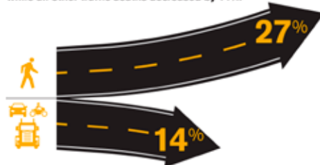
Pedestrian fatalities increased 27% from 2007-2016, while all other traffic deaths decreased by 14%.

States reported a total of 2,636 pedestrian fatalities for the first six months of 2017. Adjusting the raw data based on past